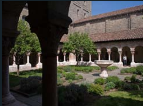
Enjoy gardens of the Middle Ages

Call (212) 923-3700 or check at entrance upon arrival. Groups of 10 or more, call (212) 650-2280 for appointment.