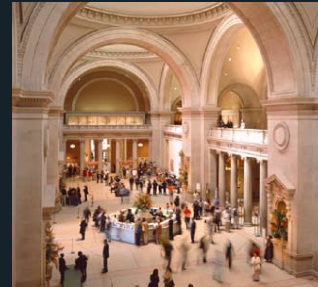
Step into the Great Hall and let the journey begin

From ancient Egyptian splendors to modern European painting, a world of art awaits you under one roof at The Metropolitan Museum of Art. Offering an astonishing sweep of special exhibitions to inspire any visitor, a permanent collection of global acclaim, dining facilities to tantalize every palate, and shops that redefine the art of gift giving, the Metropolitan Museum is the most visited museum in the United States.