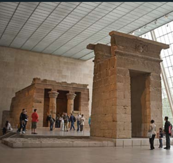
Take the kids to ancient Egypt