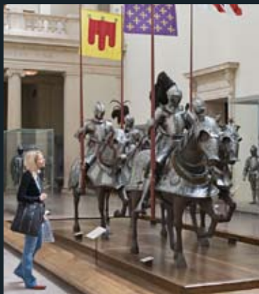
Discover knights in shining armor