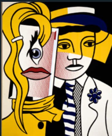
Get modern at the Met