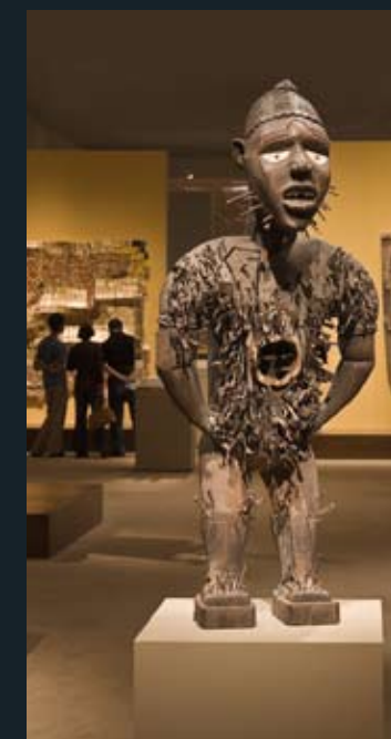
Feel the power of African art