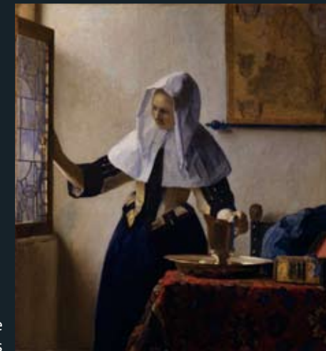
Meet the Old Masters